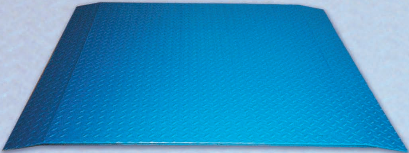
1.9" Low profile base