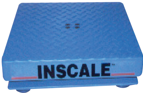
STANDARD SAFETY PLATE